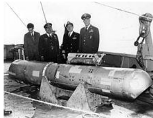
The B28RI nuclear bomb, recovered from 2,850 feet (870 m) of water, on the deck of the USS Petrel.