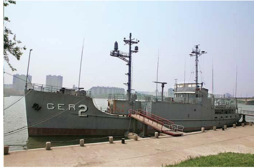
USS Pueblo (AGER-2) – Pyongyang