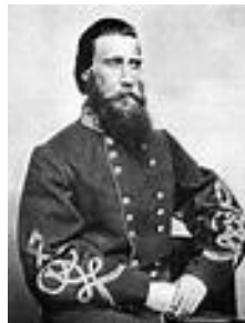
General John Bell Hood