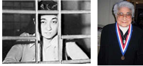
Iva Toguri aka Tokjo Rose