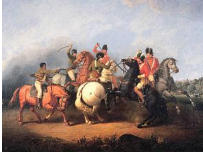
This depiction of the Battle of Cowpens shows an unnamed black soldier (left) firing his pistol and saving the life of Colonel William Washington