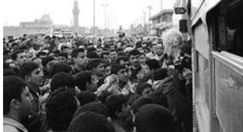
Human shields greeted as they cross the border into Iraq, 15 February 2003