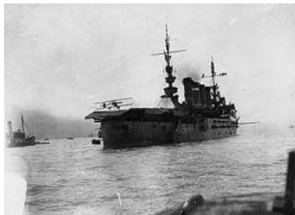
First fixed-wing aircraft landing on a warship