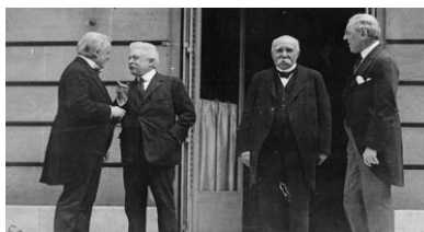
Leaders of the victorious Allied powers—France, Great Britain, the United States and Italy