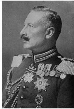
Kaiser Wilhelm II, c. 1914