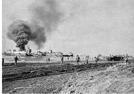
U.S. Army soldiers landing at Anzio in late January 1944.