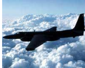
U-2 Spy Plane