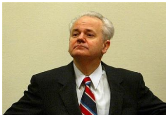
Slobodan Milosevic during his war crimes trial