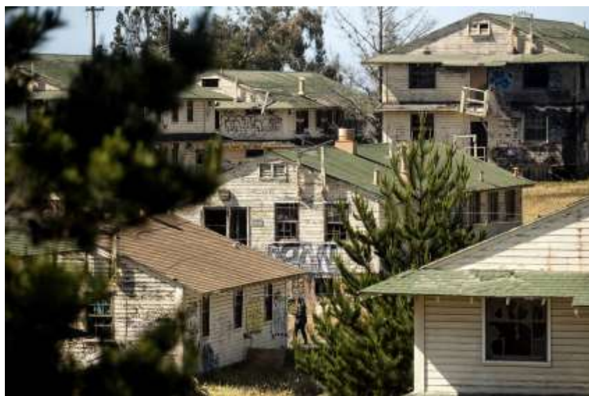
Former barracks line a hill at Fort Ord on Thursday, April 29, 2021, in Fort Ord, Calif.

Former Defense Secretary Leon Panetta grew up next to Fort Ord, went through basic training on the base and now runs a nonprofit institute there. Too often, he said, the military does whatever is necessary at its bases to ready troops for war, "and they don't spend a lot of time worrying about the implications of what will happen once they leave." Panetta said the military is abandoning communities, leaving huge messes to clean up. "I think that they have every right to ask the question whether or not whatever physical ailments they may have was in part due to the failure to provide proper cleanup," Panetta said. "And in those situations, there is liability. And somebody has to take care of people who have been adversely impacted."