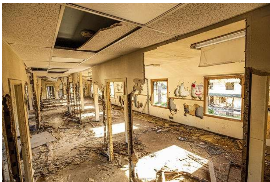
Remains of a hallway stretches down the center of barracks at Fort Ord on Thursday, April 29, 2021, in Fort Ord, Calif. Many veterans of Fort Ord who believe their cancers were caused by exposure to chemicals at the base have been denied disability and medical benefits from the Department of Veterans Affairs.

There is rarely a way to directly connect toxic exposure to a specific individual's medical condition. Indeed, the concentrations of the toxics are tiny, measured in parts per billion or trillion, far below the levels of an immediate poisoning. Local utilities, the Defense Department and some in the Department of Veterans Affairs insist Fort Ord's water is safe and always has been. But the VA's own hazardous materials exposure website, along with scientists and doctors, agree that dangers do exist for military personnel exposed to contaminants.