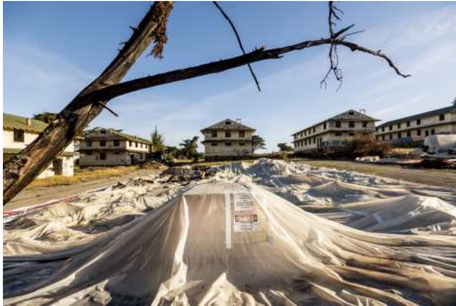
Labeled with asbestos and lead warnings, sheeting covers rubble from demolished barracks at Fort Ord on April 29, 2021, in Fort Ord,