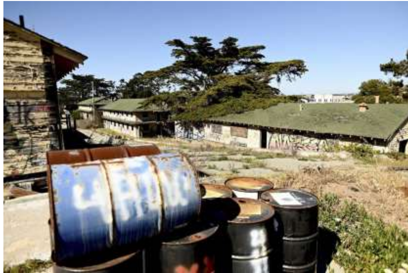
Rusted barrels rest outside barracks at Fort Ord on Wednesday, April 28, 2021, in Fort Ord